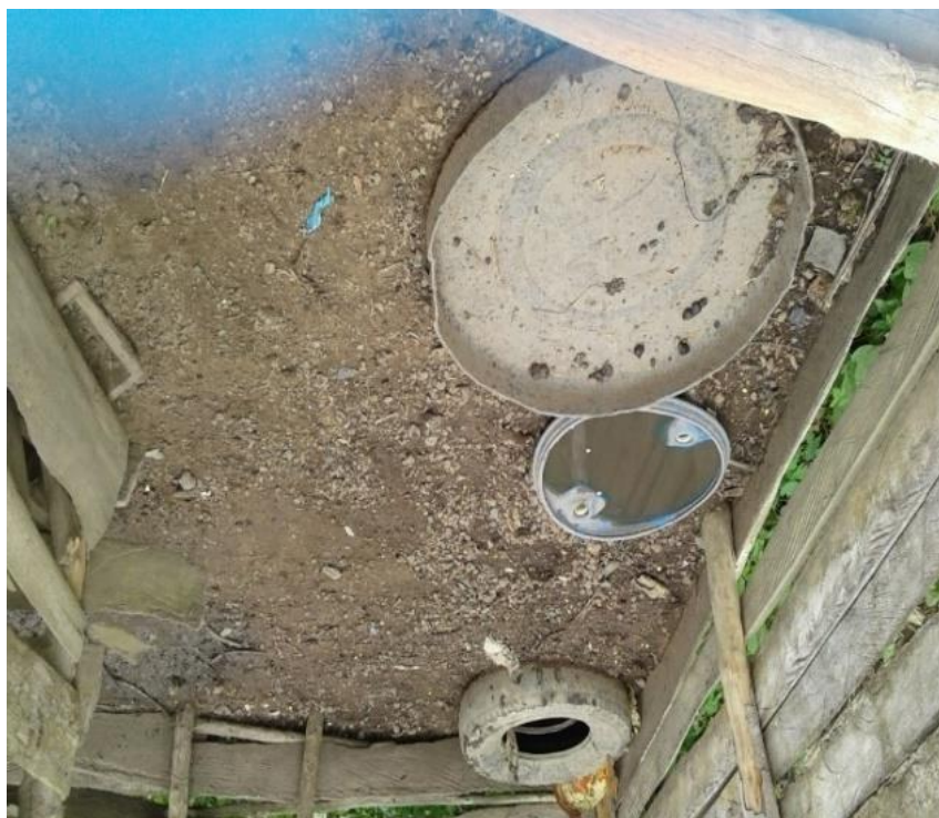
Plate 5. Feeding containers with poor cleaning practices.