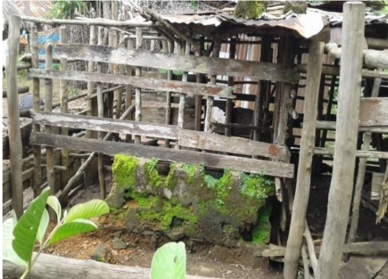
Plate 1. Pig shelter without a roof.