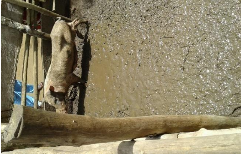
Plate 3. Pig shelter with a muddy floor.