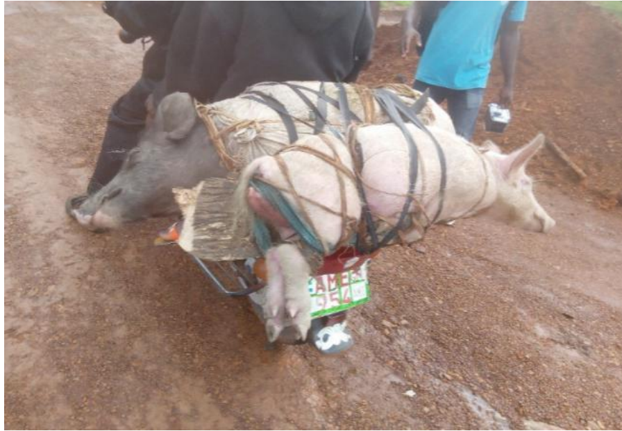
Plate 6. Plate pigs on their way to market on a motorbike.