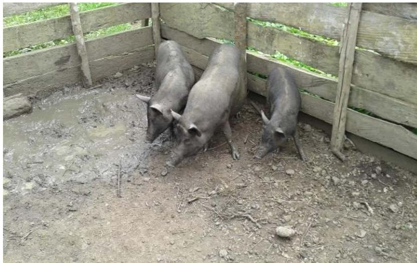
Plate 4. An open fence serving as a shelter.

reported as the most common parasites throughout the year (Figure 2). Many reports have shown pig diseases are a concern to public health (Mahanty et al., 2010) and affect pig performance (Carter et al. 2013). Most farmers observed that in the dry season, some pigs developed wounds on the skin due to continuous itching on the wall and other sharp objects. A similar observation was reported by Ironkwe et al. (2008). 80.8% of the farmers lack access to treatment services due to insufficient trained and experienced veterinarians and Animal Health workers. Because of this, farmers respond differently to the disease outbreak. 79.1% of the respondents reported to have been slaughtering sick animals to either eat or sell, 76.5% traditionally treat sick pigs, 19.1% report to veterinarians or community animal health workers while