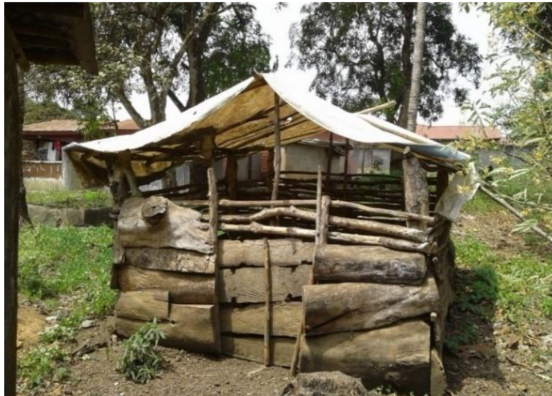
Plate 2. Pigpen built with stick and tapeline.

were lacking, hence pigs were fed in metal plates, rubber and wooden containers (57.1%) (plate 5). Bared floor (16.2%) and cement/concrete (26.7%) floors also served as feeding troughs (Table 3). The method of feeding was poor which could possibly result in infection and feed wastage.