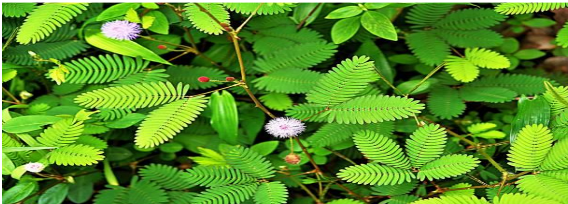
Plate 1. Picture of Mimosa pudica plant on field.